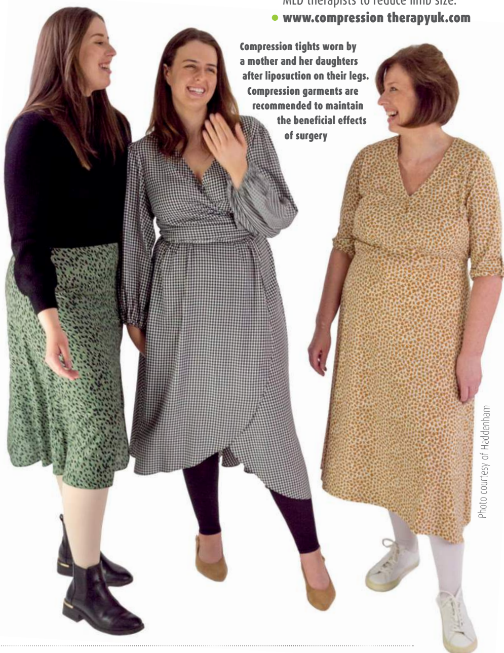
Compression tights worn by a mother and her daughters after liposuction on their legs. Compression garments are recommended to maintain the beneficial effects of surgery