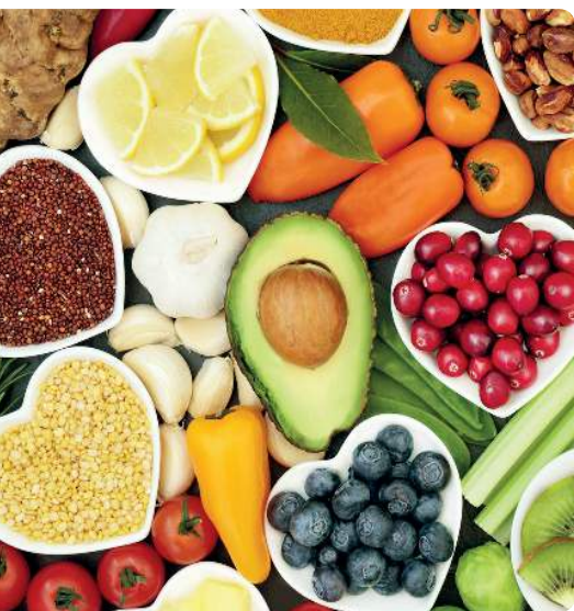
ABOVE: Diets rich in vegetables, fruits, wholegrains, lean proteins, and omega 3 fatty acids could help